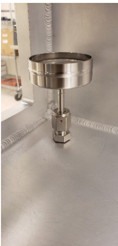
New Backfill Filter

CPS is committed to improving the availability of support material for the products in their equipment portfolio and using learnings from other established toolsets to meet this objective. CPS is pleased to announce the release of a new Backfill Filter option for the Concept One system.