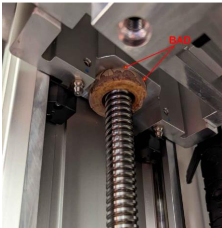
Picture of Bad Lead Screw Bump

Finding solutions for obsolete and end of life sub-assemblies still being used on our customers Legacy Semiconductor Manufacturing Equipment is a primary goal at CPS. We are pleased to announce an improved maintenance procedure for the SELG Lift Actuator and Bumper Replacement.