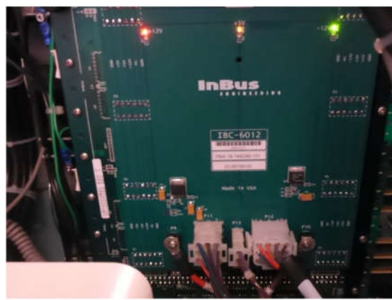
New Power Board

Fluctuation of the 5VDC signal in the Concept One system can lead to intermittent, random errors on the toolset. CPS is pleased to announce the 5VDC Monitoring and Power Board Upgrade for the C1D platform.